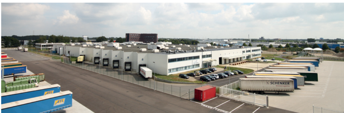
HERENTALS 17.346 m 2

Intervest Offices & Warehouses will continue to pursue its investment strategy unabated in the fourth quarter of 2014 and in 2015, the aim of which is to increase the percentage of logistic real estate in the portfolio. Intervest Offices & Warehouses analyses potential real estate transactions in the logistic sector whereby financing with borrowed capital as well as a partial consideration in shares is examined. If market circumstances permit it, the company will divest some non-strategic buildings in the office market.