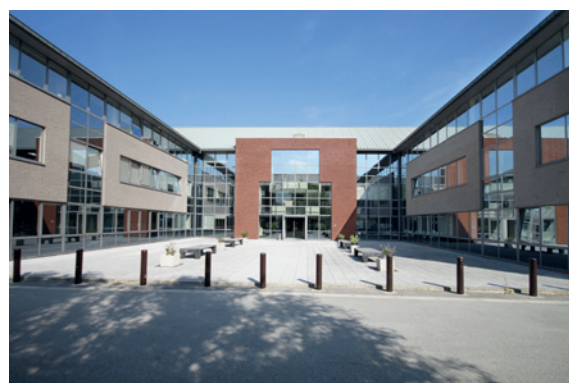
STROMBEEK-BEVER 11.182 m 2

In the third quarter of 2014 Interinvest Offices & Warehouses has realised a number of rental transactions in the office portfolio . It concerns 2 prolongations of lease contracts for an area of 2.069 m 2 and a rental volume of approximately € 0,3 million on an annual basis. In October 2014, 6 rental transactions have additionally been concluded with existing tenants for an area of approximately 9.000 m 2 .