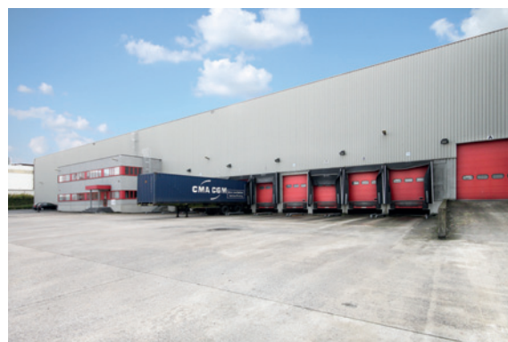
DUFFEL 23.386 m 2

In the third quarter of 2014 Interinvest Offices & Warehouses has realised a number of important transactions in the logistic segment . These transactions include 5 prolongations of lease agreements for an area of 33.154 m 2 and a rental volume of approximately € 1,3 million on an annual basis, representing 7 % of the total annual rental income of the logistic real estate portfolio of Interinvest Offices & Warehouses. One of these prolongations is related to a long-term lease agreement with Sofidel in Duffel, whereby the tenant will completely integrate its production site into the storage hall of Interinvest Offices & Warehouses (15.232 m 2 ). The agreement runs until 2026, with an interim expiry date in 2022.