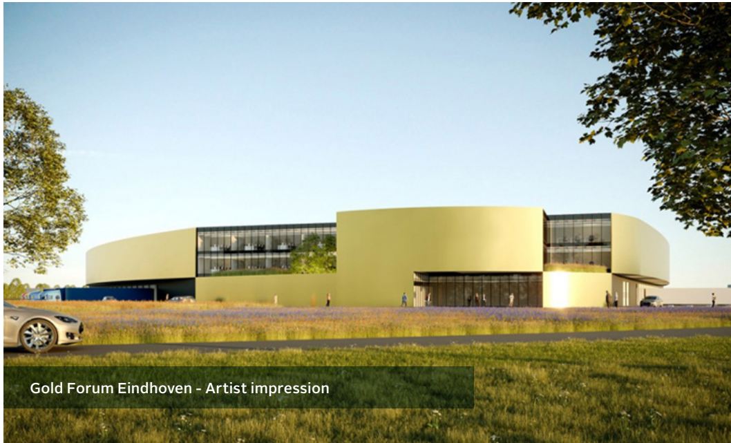
Gold Forum Eindhoven - Artist impression

Interinvest expands its logistics position close to Eindhoven airport to almost 50.000 m 2 with Gold Forum development project