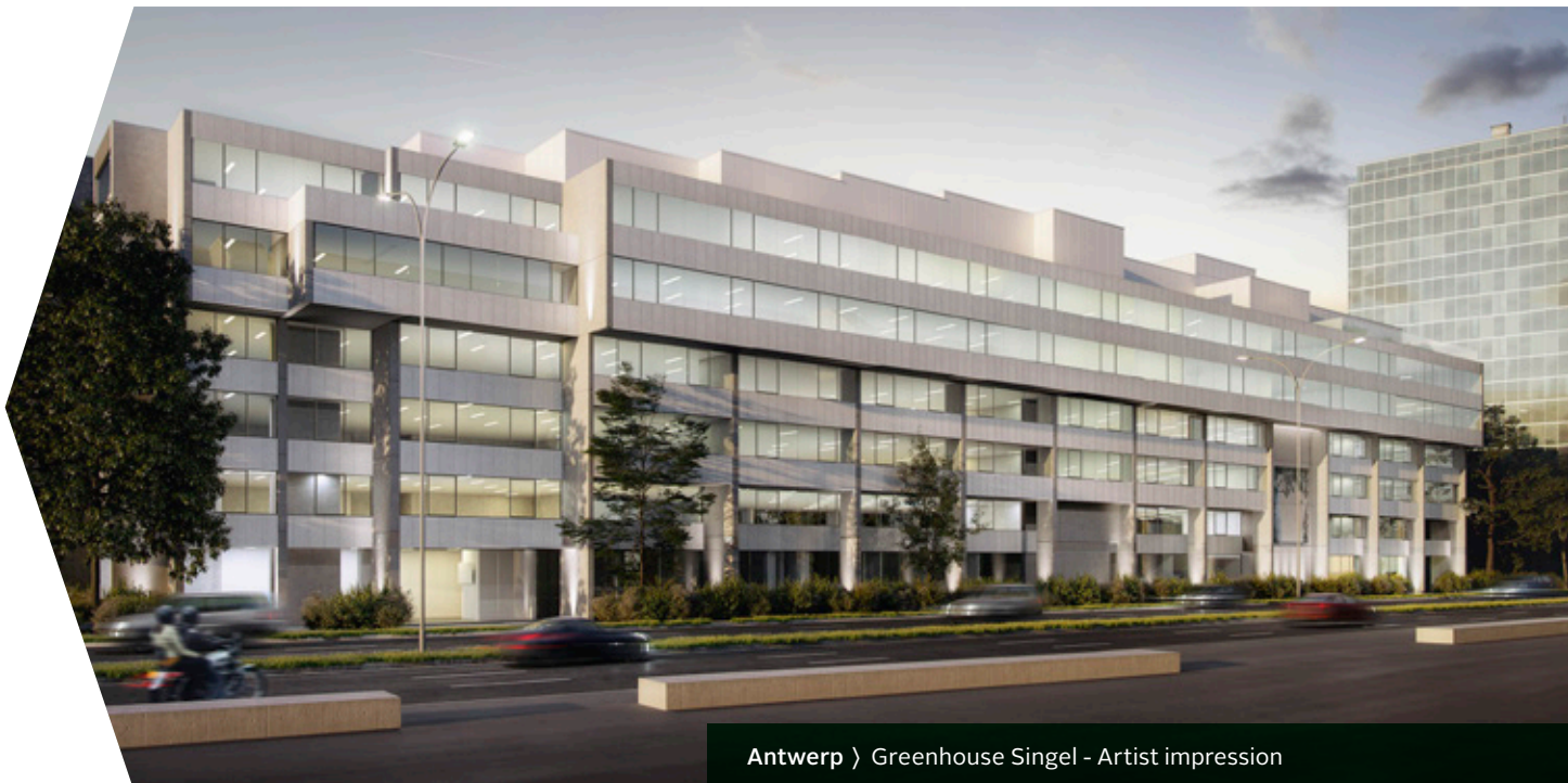
Antwerp › Greenhouse Singel - Artist impression

This acquisition is in line with the #connect2022 strategy whereby within the office segment asset rotation is implemented in order to improve the risk profile of the entire portfolio. This is translated into a reorientation towards more future-oriented buildings in cities with a student population such as Antwerp. And promptly it means that striving for sustainable value creation with the own team takes shape.